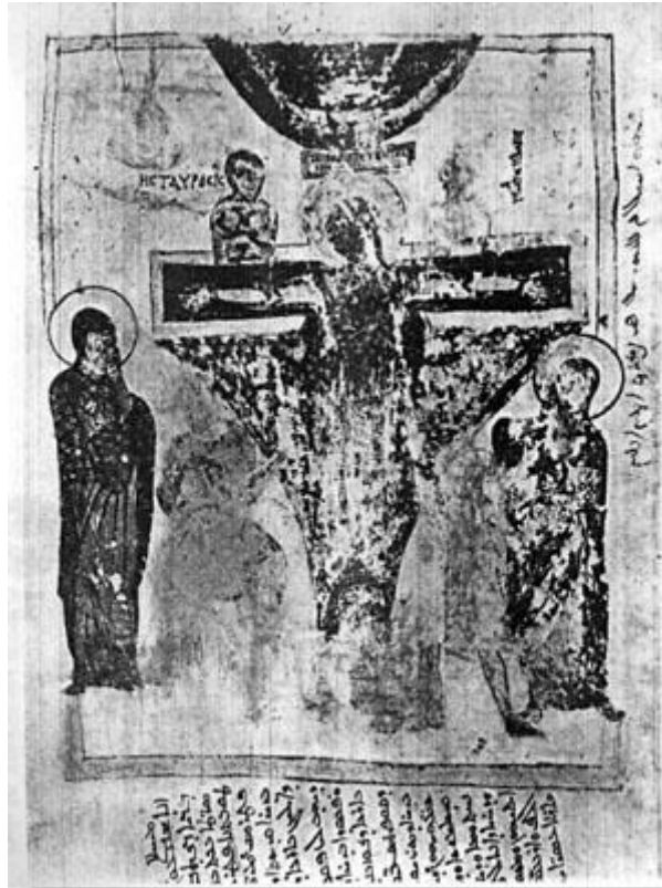
Syriac Manuscript Vat. Syr. 118 f° 262 r of the Vatican Library Leroy, J. Les Manuscrits Syriaques A peintures Conservés dans les Bibliothèques D'Europe et d'Orient, (Paris, 1964)

Available historical documents confirm that the Maronites were an active community in Cyprus prior to 1192 A.D. The oldest manuscript accessible in this regard dates to the twelfth century -- Syriac Manuscript Vat. Syr. 118 f° 262 r of the Vatican Library. This manuscript contains a handwritten inscription in Syriac, translated as follows: